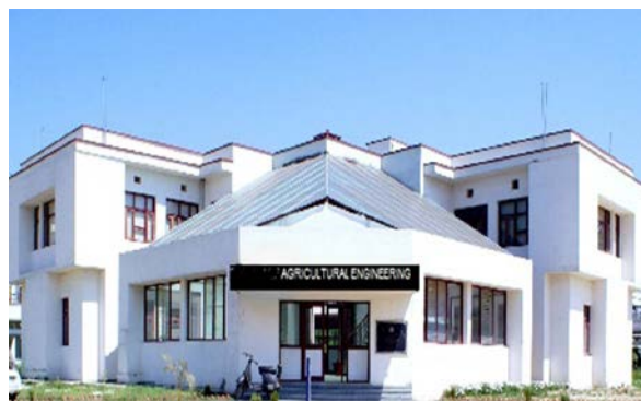
Faculty of Agricultural Engineering

instructional and research farms, modern instruments/equipment's, farm machinery, transport and library facilities. It has distinguished and qualified faculty positioned at all the campuses and regional research stations. The faculty members and the post-graduate students of the University have won numerous national and international recognitions in the forms of awards, honours and fellowships awarded by the prestigious professional scientific bodies/societies.