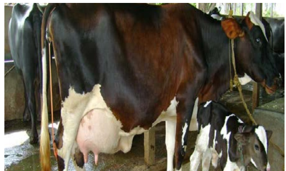
Faculty of Dairy Technology