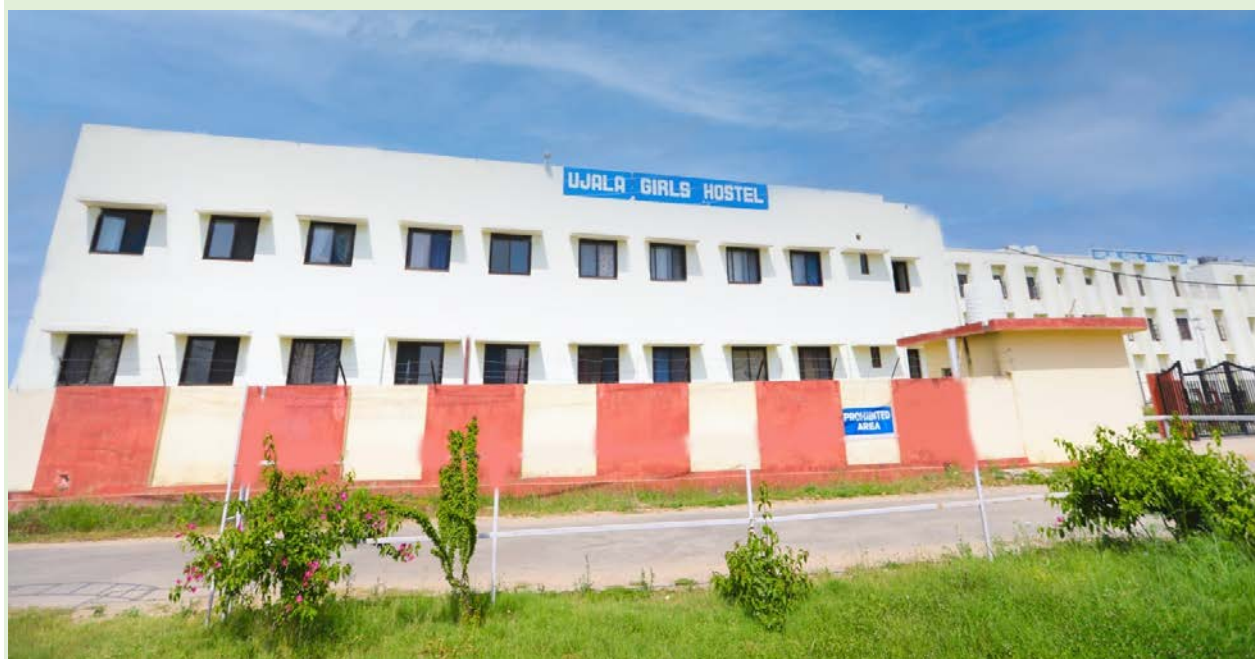
UJALA Girls Hostel

Students are not allowed to use any four/two wheeler during the stay in the University campus.