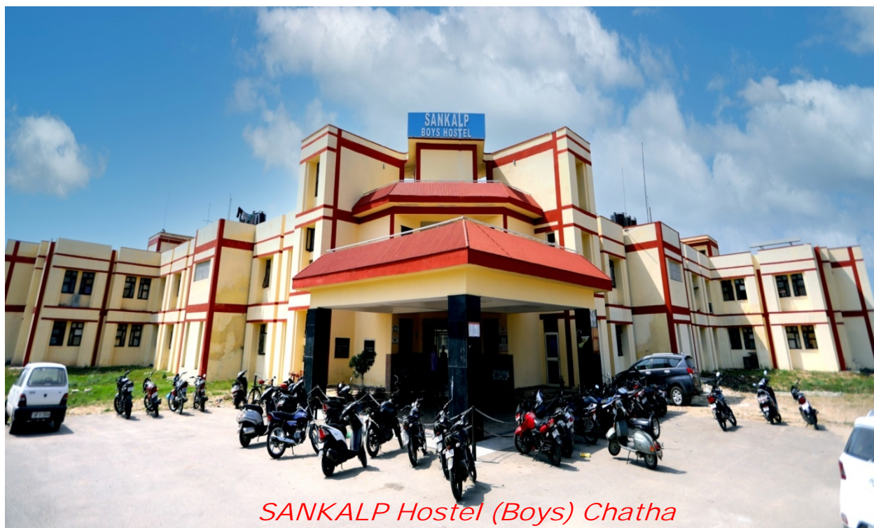
SANKALP Hostel (Boys) Chatha