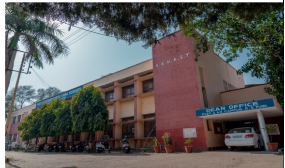
Faculty of Veterinary Sciences & Animal Husbandry Agricultural