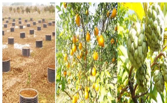
Faculty of Horticulture & Forestry