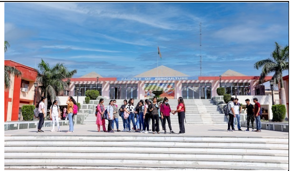
Faculty of Agriculture

The University has highly structured infrastructure facilities in terms of buildings, laboratories, lecture rooms,