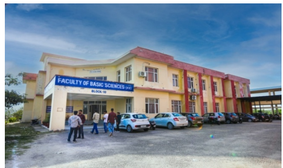
Faculty of Basic Sciences